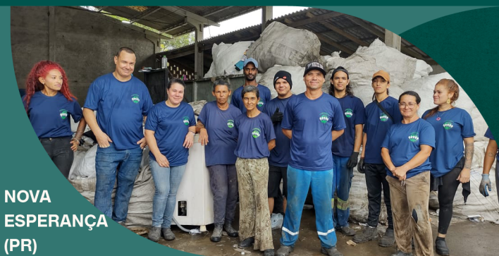
NOVA ESPERANÇA (PR)