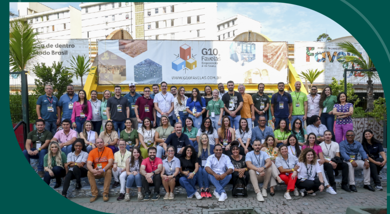
Annual volunteer meet in 2023, in Paraisópolis, at the G10 Favelas (SP).

World Food Day, blood donation, social inclusion initiatives