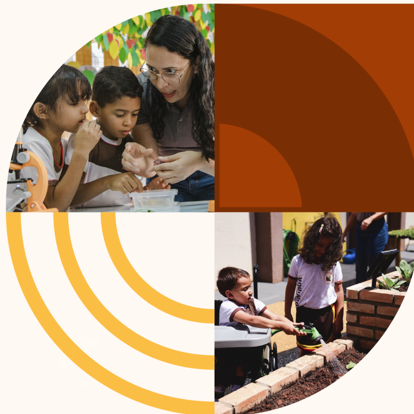
Professora Ediene da Silva Dias Municipal School, in Ouvidor (GO).

Additionally, the program addresses training of the teaching team to help them carry out reading-support initiatives and educational projects involving healthy and sustainable. Preparing these stakeholders to address this agenda with students, teachers, workers and family members.